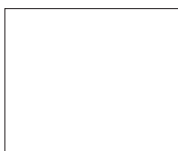
Rectangle 180 x 150